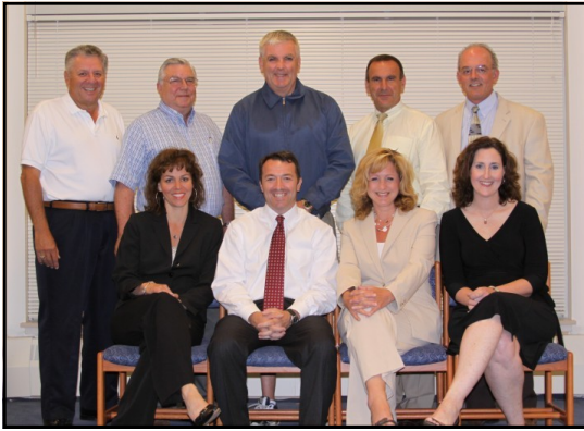
2009 SEF Board of Directors.